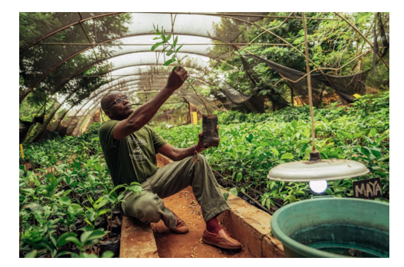
<u>The Kasigau Corridor</u> <u>REDD+ project</u>

In Kenya, we're supporting the Kasigau Corridor REDD+ Project, which protects over 500,000 acres of dryland forest and is home to more than 300 threatened or endangered species, including 11,000 elephants. The project provides economic alternatives to unsustainable activities such as poaching, slash-and-burn agriculture and illegal harvesting for charcoal, resulting in benefits for 120,000 community members.