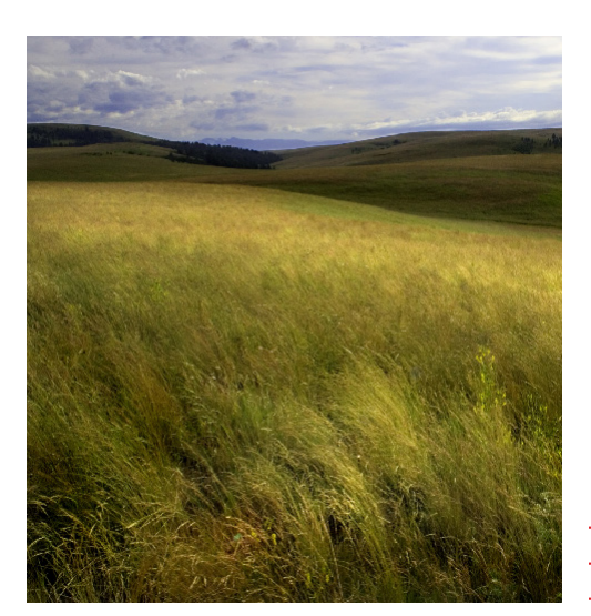
<u>The Oregon Grasslands Project</u>

Among the projects we're investing in is the Lightning Creek Ranch project in the State of Oregon, preventing the loss of North America's largest bunchgrass prairie. The investment would help landowners prevent farming that land and enhance natural carbon removal systems.